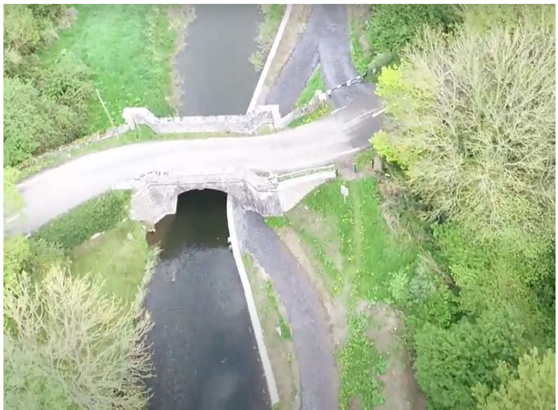
Underbridge Access Reopened at Devonshire