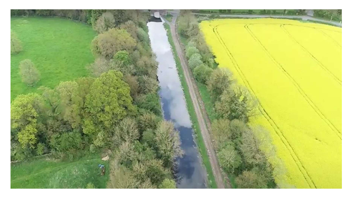
Greenway Complete to Capping between Devonshire & Ponsonby