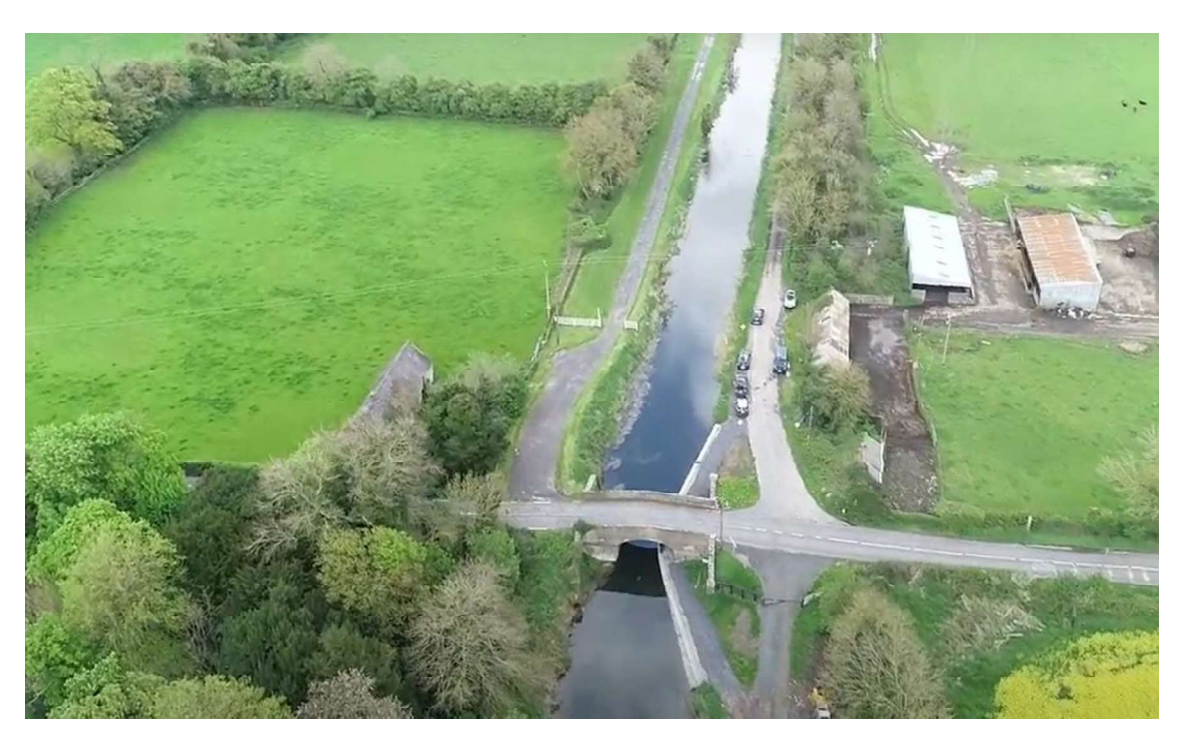
Access Reopened Under Ponsonby