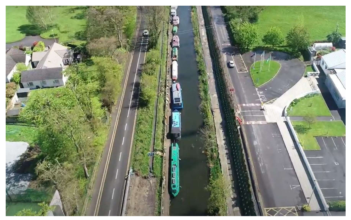
Soil Nailing/Hydroseeding along Church Rd