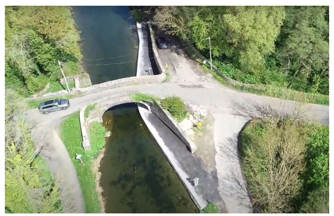
Access Reopened under Henry Bridge