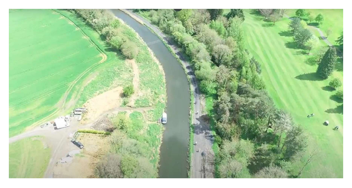
New Greenway Complete to Capping along Golf Course. Note active cyclists on Greenway