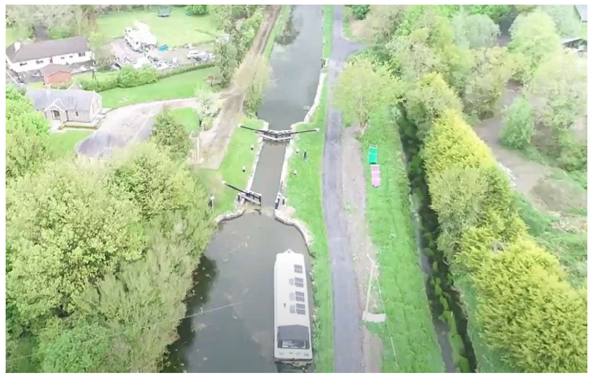
Works at Lock 15